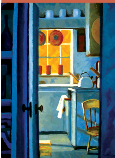
Philip Koch (b. 1948), Truro Kitchen , 2016, oil on canvas, 40 x 30 in.