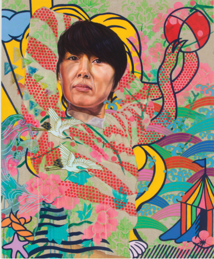
Kira Nam Greene (b. 1967), Sun with a Beach Ball , 2018, oil, acrylic, and Flashe on linen, 30 x 24 in.